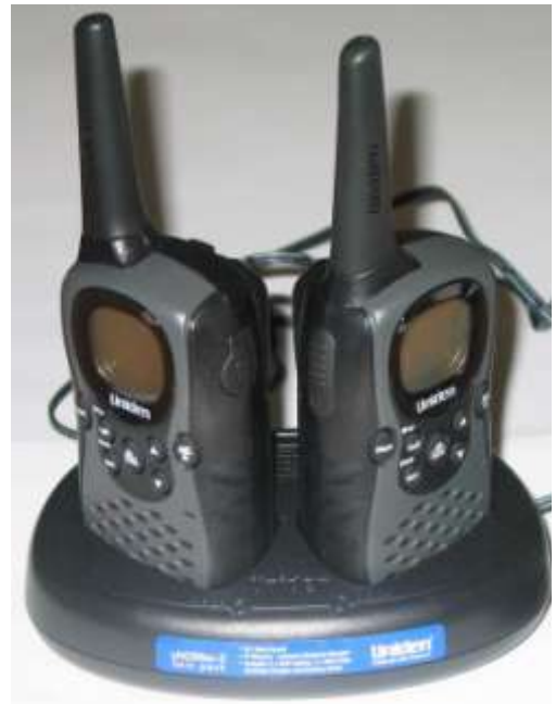
The new Uniden radios.