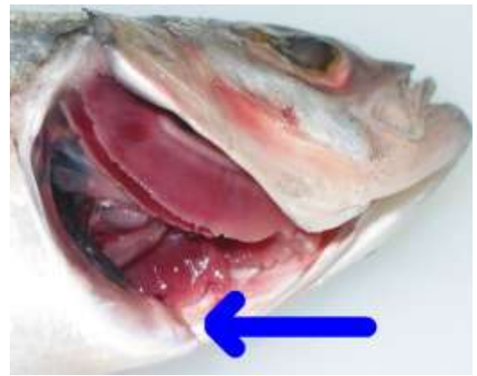
First cut here.

Result. You will now have very clean, scaled, gilled and gutted fish ready for weigh in for the club Field Day competitions, for short term storage, for filleting (which can be done later), or for cooking whole or headed.