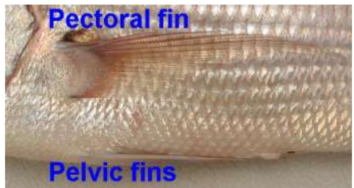
Locations of fins.