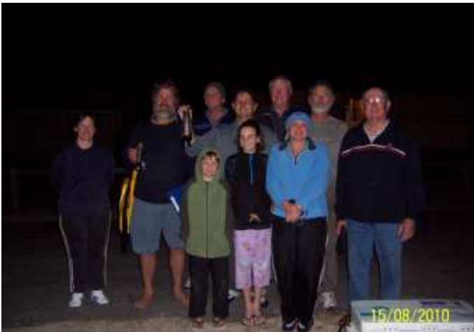
Surfcasters at the August 2010 weigh in.

Spirits were high and all were very helpful and in no time all our gear was securely stowed away in the crates for the journey across to Rottnest Island. While waiting for our departure we had a cuppa and quickly caught up with everybody's news. However, the main discussion was the fairly high swells that were predicted for the weekend. The trip across felt very short and with only a few heavy bumps we arrived safely at Thompson's Bay in a very light rain. Soon we were all settled into our Bungalows.