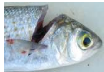
Alternative for small fish.