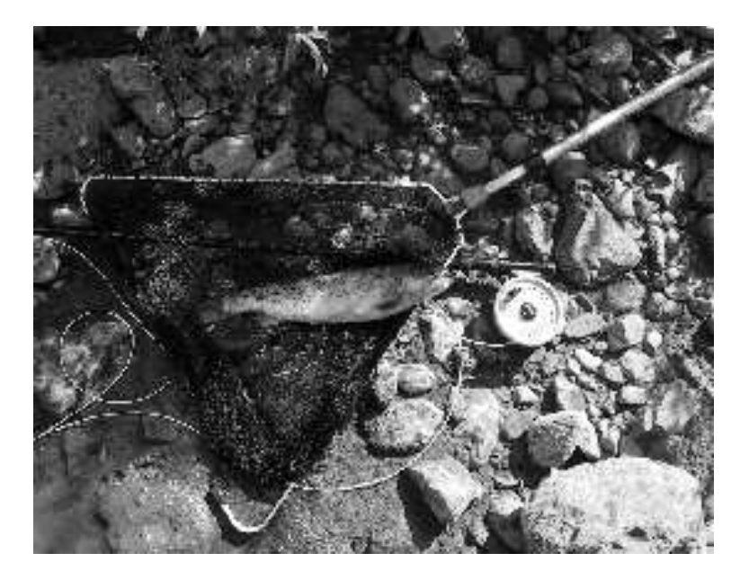
A 33cm trout from these waters is considered a good fish. The distinctive red markings on the fish's throat give the Cutthroat its name.

which meant that in order to be able to cast I had to wade up the river, climbing over boulders and fallen trees, casting upstream as I went.