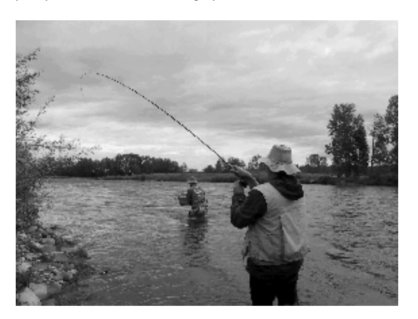
Playing a big brown hooked whilst nymphing on the Bow. The fish was lost at the net.

By way of the Bow River, Calgary has one of the best trout streams in the world running through it and