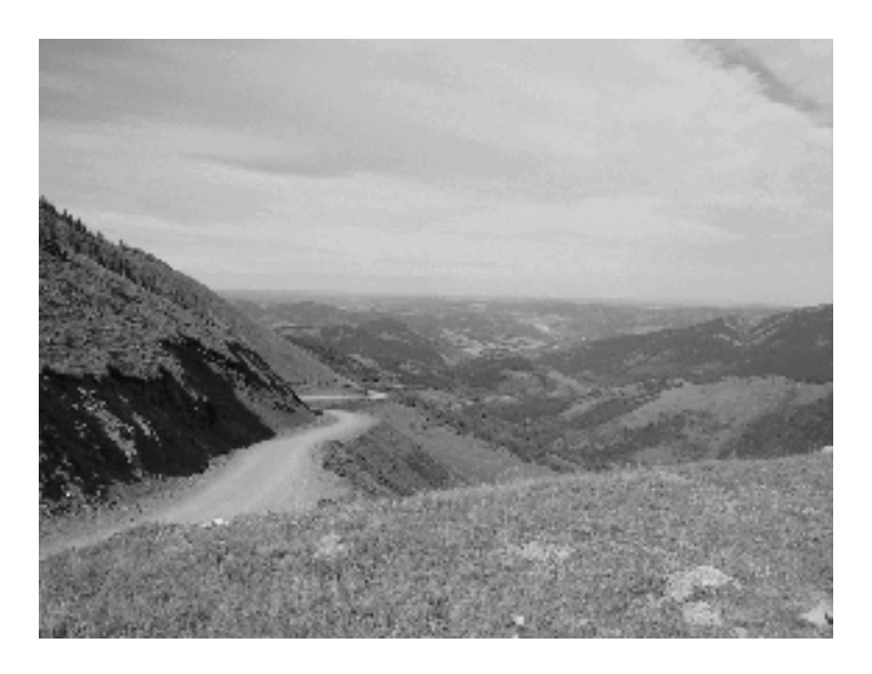
Highway 532 takes you from the upper reaches of the Oldman River back toward Calgary.

Saturday morning saw me up fairly early and rather than cover the same water as I had the day before, I decided to head further up stream. The scenery was even more spectacular and the trout here were even more plentiful than the area that I had fished the day before, even if they were noticeably smaller. The larger fish were only about 20 to 25cm in length and the smaller fish......... Well I don't think that we need to go there.