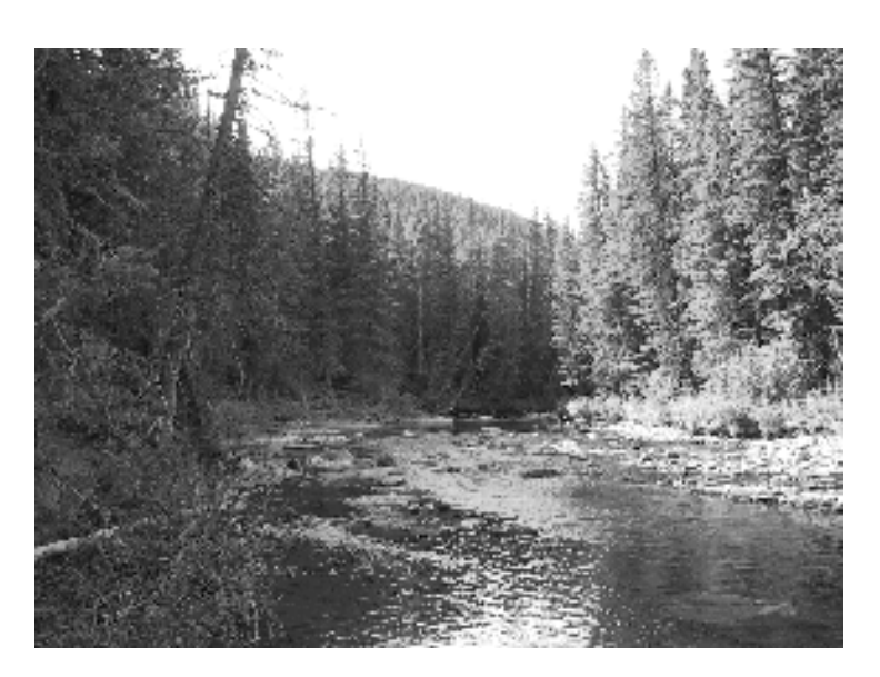
The Upper Reaches of the Oldman River.

Then someone suggested that I forget the Bow for the moment and build my skills (and confidence) where the fish were smaller, but a lot more willing to take a dry fly. With that purpose in mind I packed some camping gear and headed off into the Rockies where the tributaries of such big rivers as the Bow and the Oldman are nothing more than small and beautiful streams.