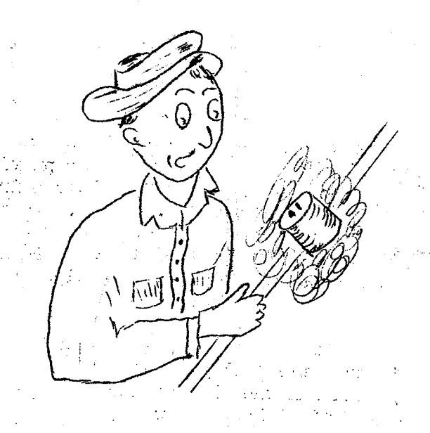
" __ and it didn't happen at Knight."

By lunch time all were on their way home thinking up excuses that might prove convincing.