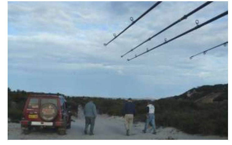
Where to now?

Off we went, following George's Nissan. Bitumen turned to gravel, then I started to get concerned when George got out and engaged the front wheel 4WD locks. The X5 is not a true 4WD. It's an all-wheel drive and I've never taken it off road so was unsure if we could follow the Nissan. George turned off to Dunn Rock and after leaving the gravel we encountered limestone tracks, sand and bottle brush bushes which all wanted to scratch the hell out of the X5. Finally we ended up at the beach and after looking at the water decided that this was not the ideal place.