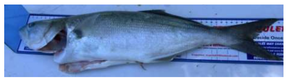
If only we could catch tailor like this (54cm) on all field days.

I managed a couple more tailor and herring, flathead, a small wrasse, another whiting and a skippy. One of the tailor was one of my best for a while at 1.22 kg gilled and gutted which would have been 1.5+ kg as landed.