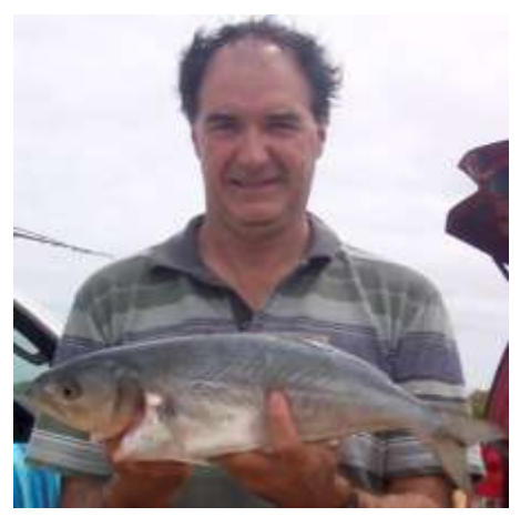
Shane's biggest tailor – 1.1 + kg

Now my story goes as follows: - Following sign-on, on arriving at the mouth of the Hill River and getting my rod set up with mulie bait and into the water at 12:05 pm, I managed a tailor by 12:10pm. Continuing I had 5 species by a little after 1 pm. I thought that despite the wind and weed It looked liking shaping up to a good weekend. Not so, nothing much happened over the rest of the afternoon. Adding to the species caught by 1 pm, I managed odd skippy, whiting, herring, flathead (just size) and a good tarwhine all caught on 3/0 ganged hooks.