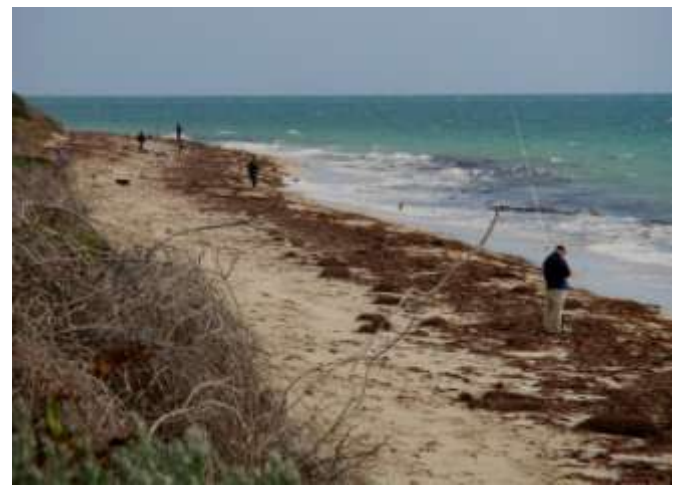
Weed everywhere here

During the afternoon Eddie and I walked up and down the beach looking for an area where at least the weed was not as thick or wide.