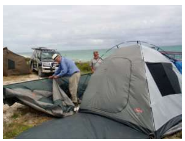
Victor and Eddie setting up the tent

It was great to have Deb and Eddie camping next door and with the wind blowing a mini gale and the weed moving every time you looked at it, we decided to have a cup of tea.