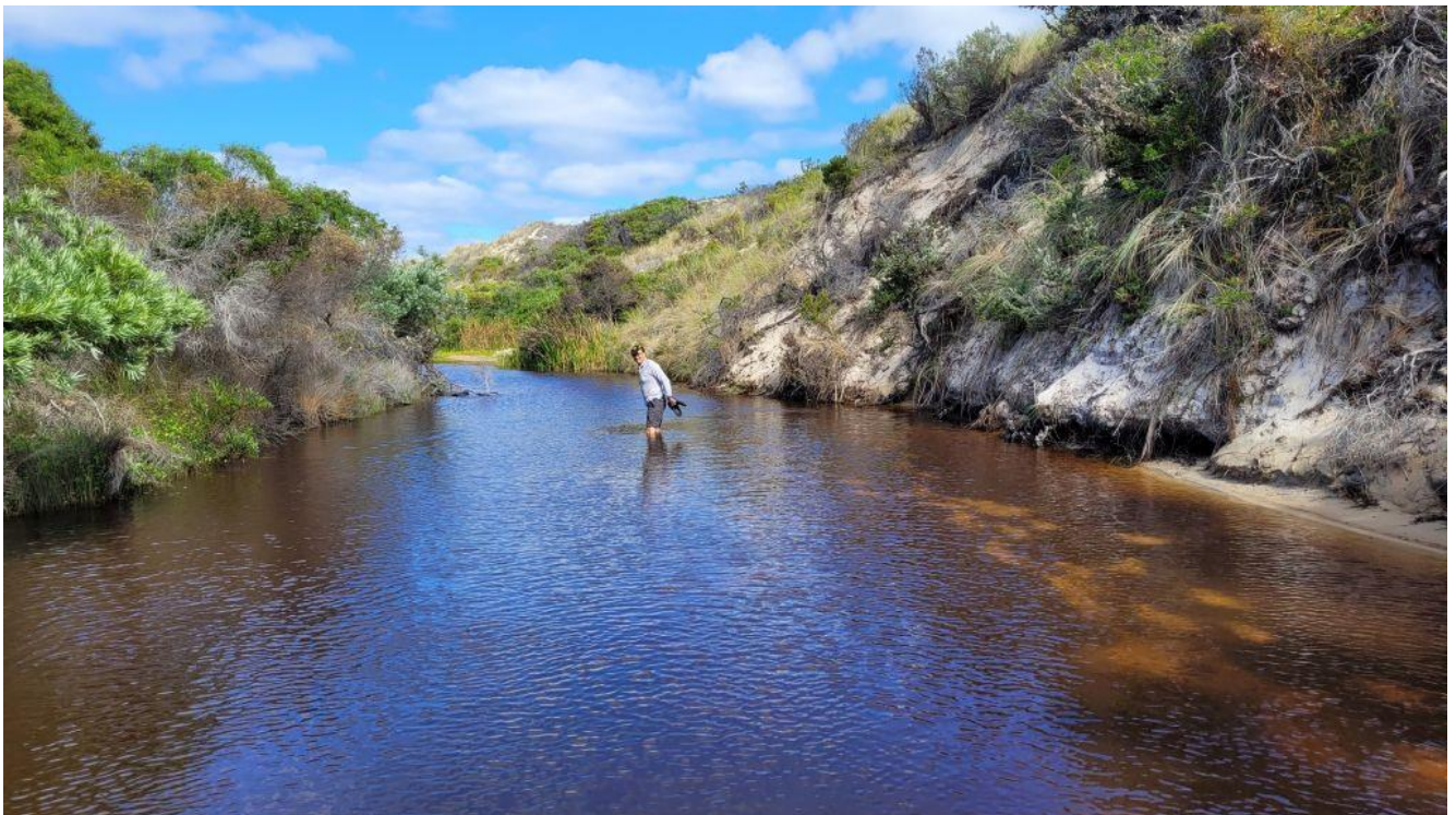
Creek a bit deep to cross for us

We arrived at the track at 1pm and after letting down the tyres we made our way to the beach, once over the last sand dune the water looked good, as usual a nice gutter running the whole way along the beach, the width of the beach was a lot less than our last trip, as we got close to the reef area it got even thinner and at high tide I could see the water was lapping at the sand dunes and would not be passable but the tide and swell was low so we got through to the creek we normally camp at ok,