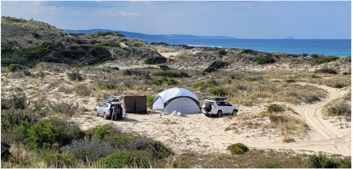
We had the only camp next to the creek