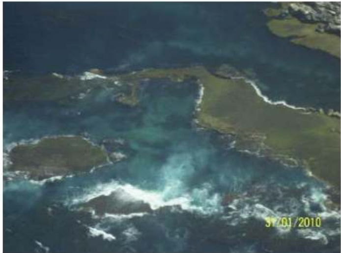
Rottnest's Radar Reef

Afterwards it keeps me lying awake in bed replaying the excitement over and over and then I can't wait to get back there again.