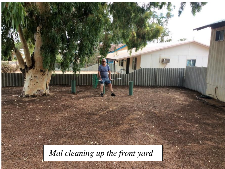
Mal cleaning up the front yard

It was soon time for us to pack up after our month away with our special families and head back to the hustle and bustle of suburbia until next time.