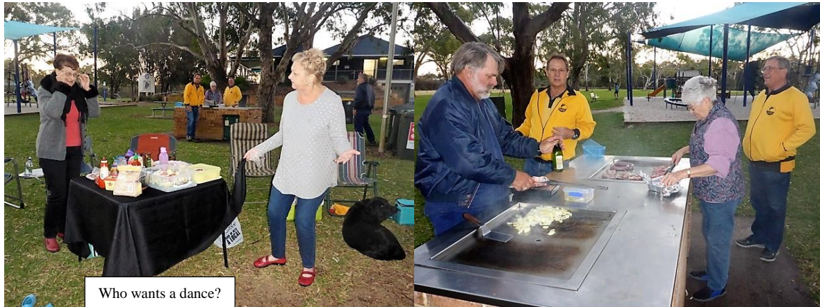
Who wants a dance?

Thank you, to all members who support the monthly meeting raffle.