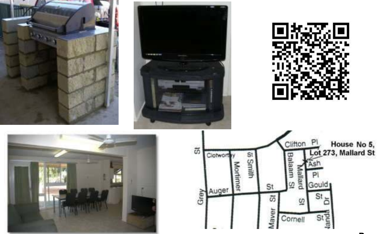
Reel Talk July 2016