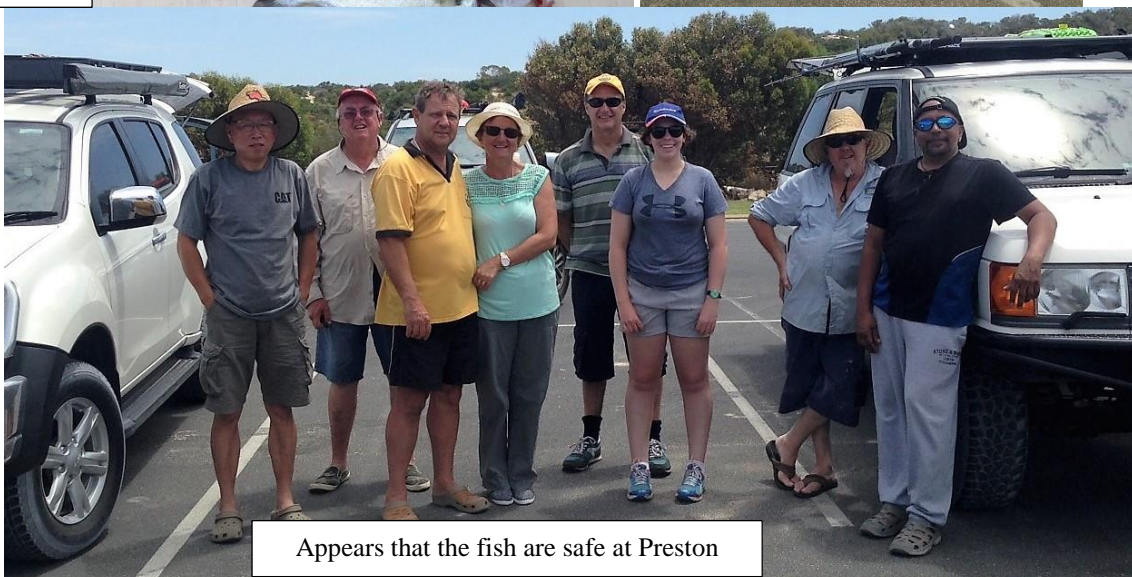
Appears that the fish are safe at Preston