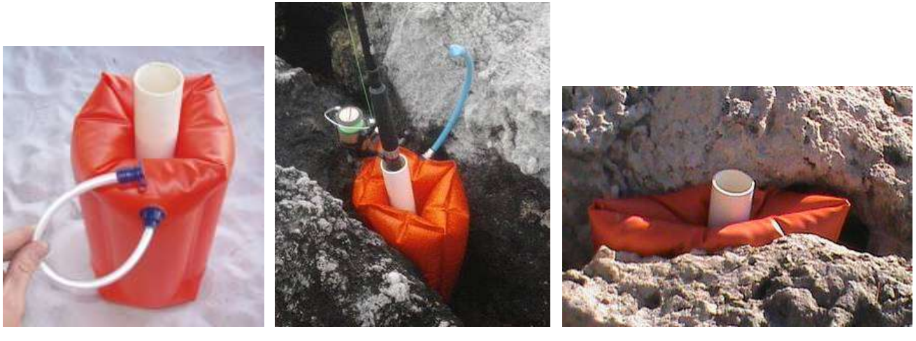
Reel Talk Editor, Terry Fuller

Here are some photos of the device in use in limestone rocks like used in some metro rock walls. You can check out more at <u>www.rocksteadyrodholder.com</u>