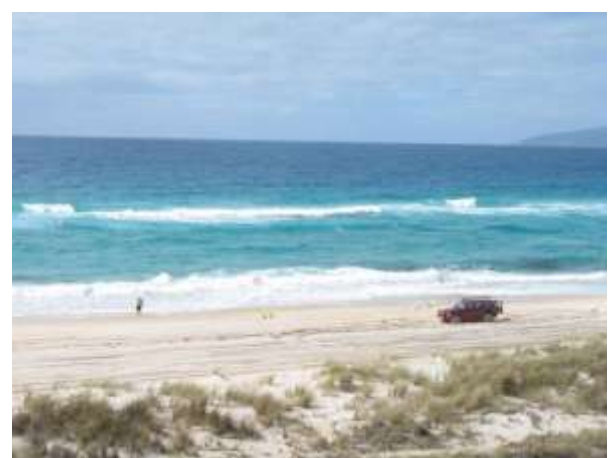
Miles of beaches like this !!!!

The beaches and water are in pristine condition so it is really a very pleasant spot to just relax and enjoy the outdoors and the fishing.