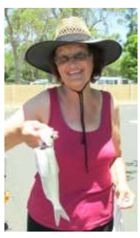
Some of the herring were a good size