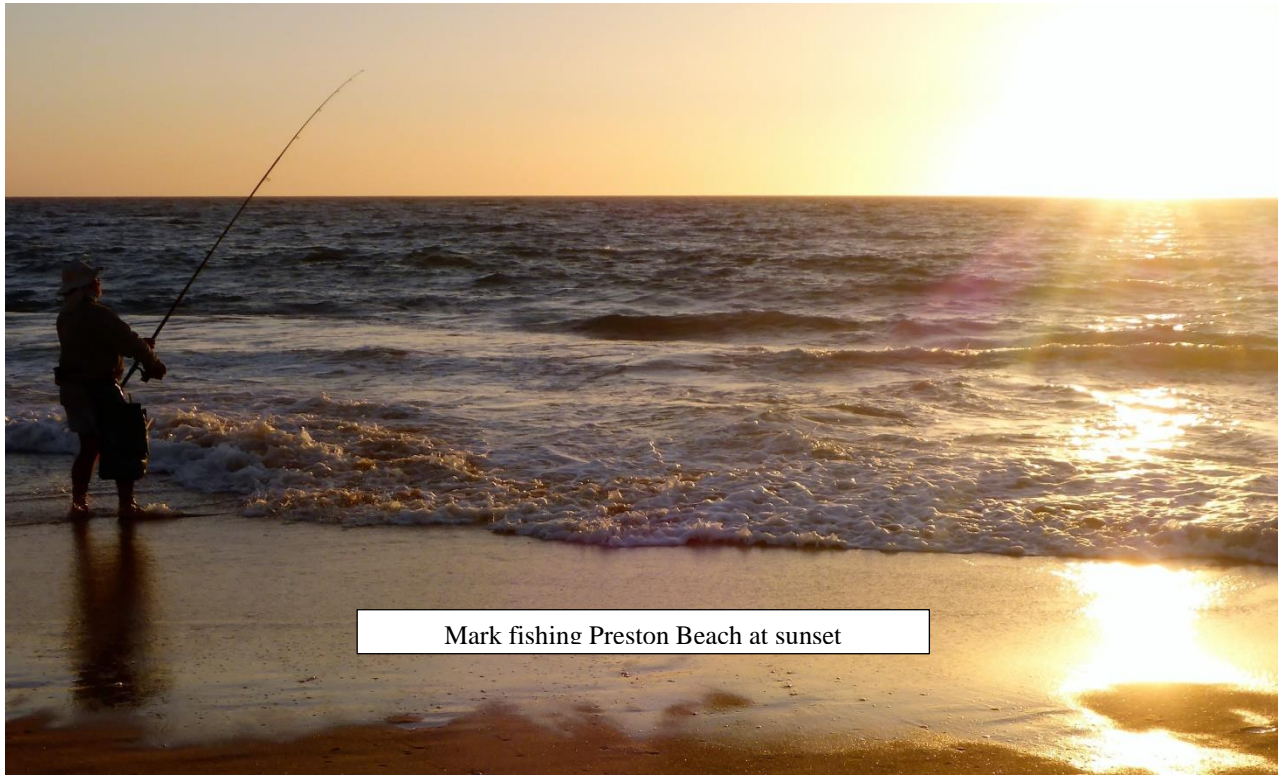
Mark fishing Preston Beach at sunset