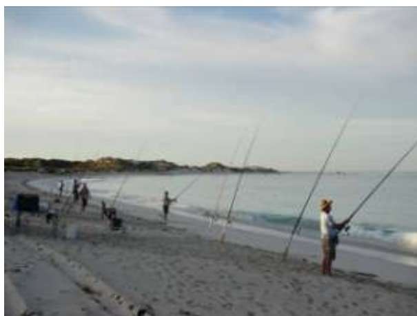
Surfcasters hit Sandy cape and soon have a barrage of mulies hitting the ocean

The following morning on getting up out of bed in dribs and drabs from 4:30 am, within an hour, everyone was wetting a mulie. Again calm conditions prevailed and fishing was very slow, then, a little after 7:00 am a fairly strong SW wind made an appearance. (Would guess 15+ km/hr) Only 5 minutes later, like switching on a light switch, Tailor schools came appeared in front of us all. Looking south to a sea of rods there were fish coming in every couple of minutes. Everyone, including Martin's friends completed their bag limits before the fish switched off a little more than an hour later. They were not huge Tailor – generally in the 33 to 43cm range, but provided a good bag of eating fish. Some of us fished with a second small hook rig above the mulie, resulting in an odd Herring coming in. Peter O managed one of his Herring on a 3/0 hook. Peet managed to land a stray one-off Dart to give him three species three - highest for the field day. This again reinforced that the best Tailor feeding conditions require a SW wind of 15 km/hr or more.