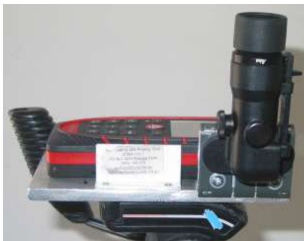
Telescopic viewfinder fitted to new laser on tripod.

One possible fix was to put a fold out white border down each side of the target so that it could be seen more easily in the LCD screen.