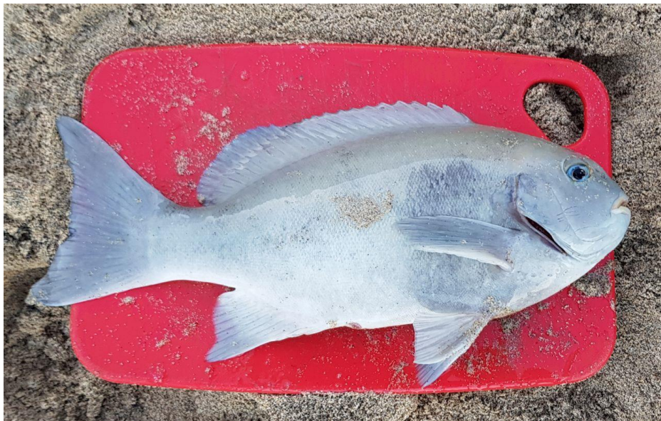
Western Buffalo Bream