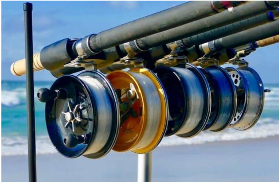
Alvey Reels was one of the oldest family-owned fishing companies in Australia.

ALVEY Reels, an iconic Australian fishing tackle manufacturer, has just announced it will be closing down. Alvey was founded in Brisbane in 1920 and is one of the oldest family owned fishing companies in Australia.