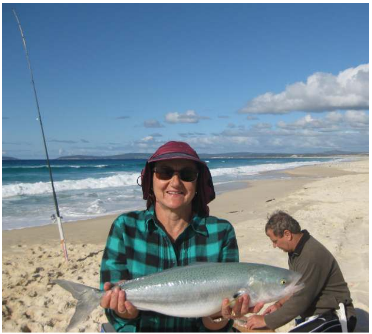
Management addressing the Board, the bait board that is, and the results...