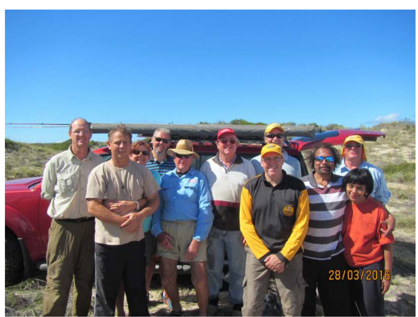
Some of the Bluff Crew