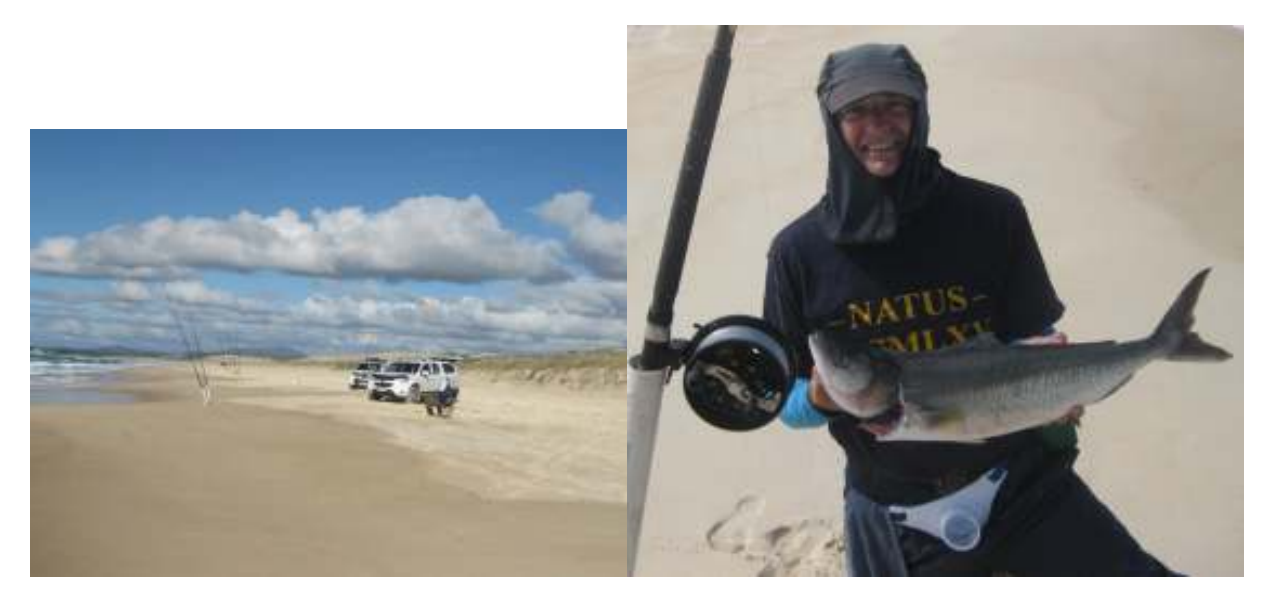
It's tough at most field days...