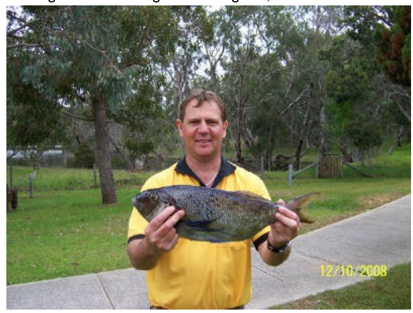
Peet with Queen Snapper

Weather was reasonably good with the odd shower coming through with a stiff breeze at times. Fishing around the big rock was good, as we were able to keep the wind at our backs.