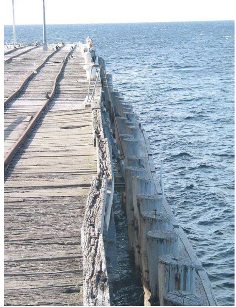
The end of Busselton Jetty. How many more winter storms will it survive?