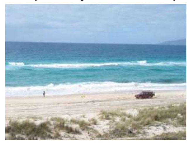
Miles of beaches like this !!!!

In past years, a barbecue has been held from 12 noon Sunday to 2 pm Sunday. It's a great time for socialising with your fellow club members and yet another highlight of the Bluff Creek field day when we go back to how field days used to be "in the good old days".