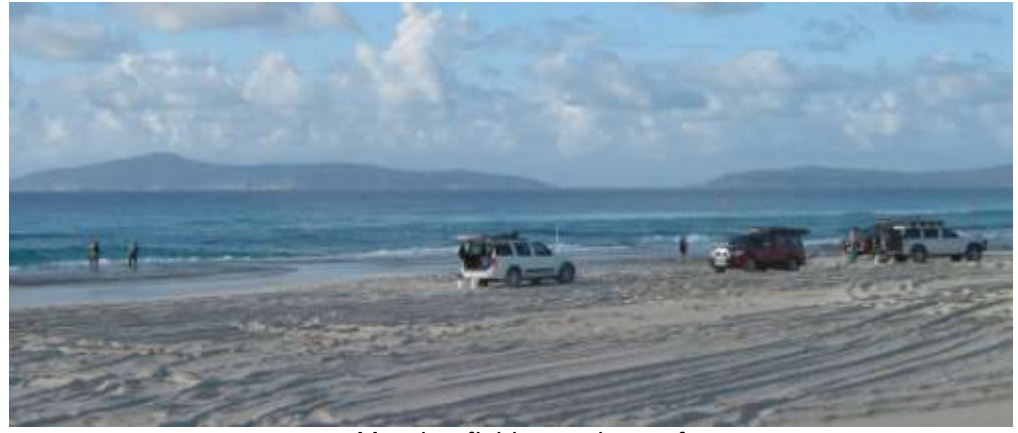
Morning fishing at the reef.

Usually a group of members go down in convoy to Bluff Creek on the Friday morning so anyone wishing to join in please raise this at the General Meeting.