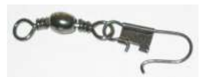
Snap swivel. (not recommended)

One quick and simple way is to use a "Coastlock Snap" clip or similar, make loops of the thread passing through the hole, cut the loops and then tie the threads into a pompom shape using some strong thread near the clip.