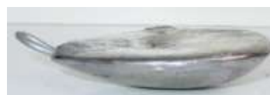
Side view showing the smooth rounded bottom and upward angle of the wire.