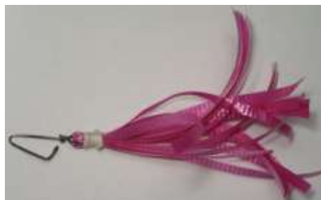
Finished pompom on clip