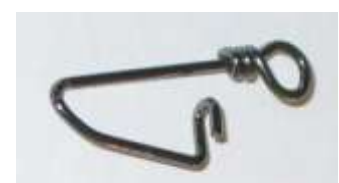
"Coastlock Snap" clip