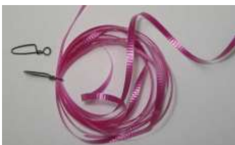
Threads passed through the clip