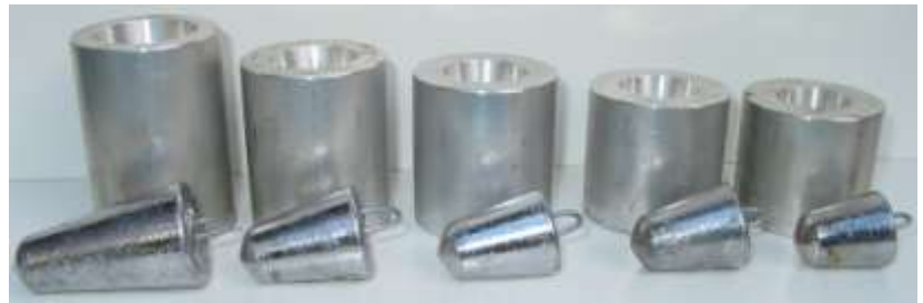
Bucket sinker moulds in a range of sizes.

Some club members have sets of different sized aluminium moulds for these sinkers. The sinkers here weigh 350 grams, 200 grams, 170 grams, 165 grams and 120 grams. Weight varies a bit depending on how full the mould is. Much lighter sinkers can be made by only partly filling the mould.