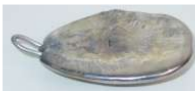
A home made spoon sinker.

Spoon sinkers can be made using stainless steel spoons as moulds, using some galvanized wire bent into a U shape with the ends bent at right angles to anchor into the lead. Bending the wire up about 30 degrees where it comes out of the sinker means the line pulls the front of the sinker upwards and increases the planing effect as it is dragged through the water.