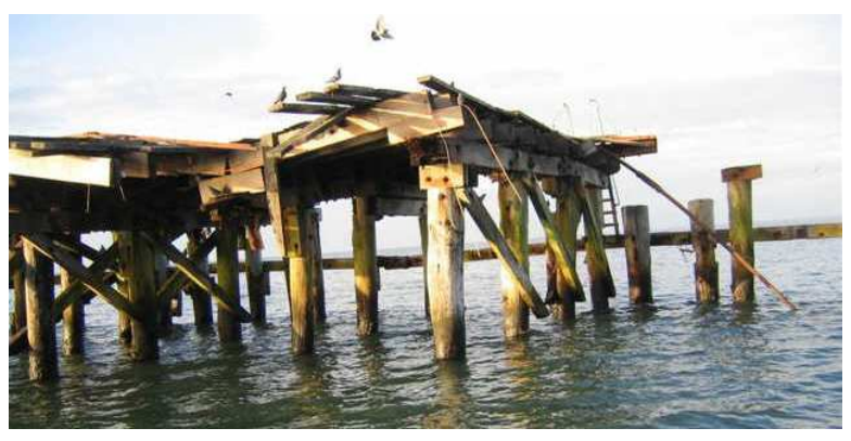
Landward end of the remainder of the jetty - looking north east.

That part and all the rest of the end of the jetty was in very poor condition. Damage from a big storm could have been expected by anyone who looked at the end of the jetty.