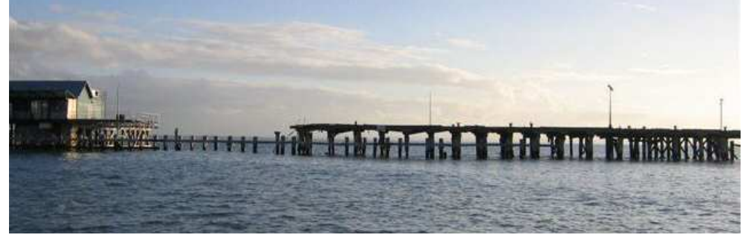
The missing bit - Underwater Observatory building on the left, end of the jetty on the right.

He said the underwater observatory didn't have the steel cover on the window closest to the surface. Who knows if the deeper windows have been damaged?