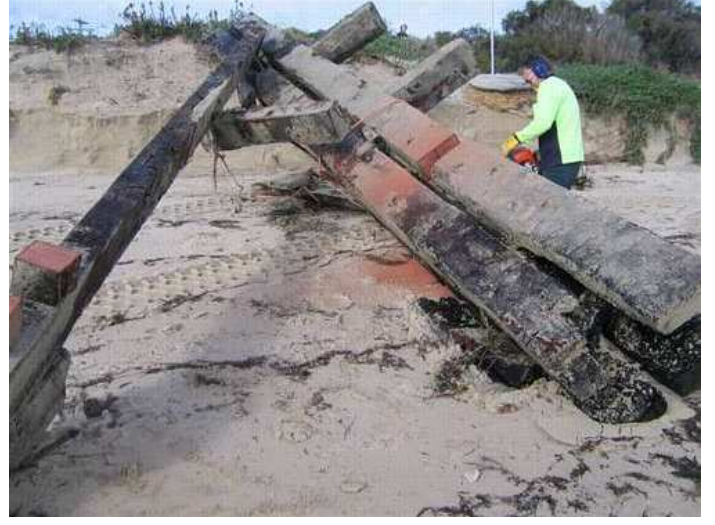
Big timber! Some of the pieces of the jetty washed up on the beach.

It would always have had to be completely rebuilt with new piles and sub structure and decking.