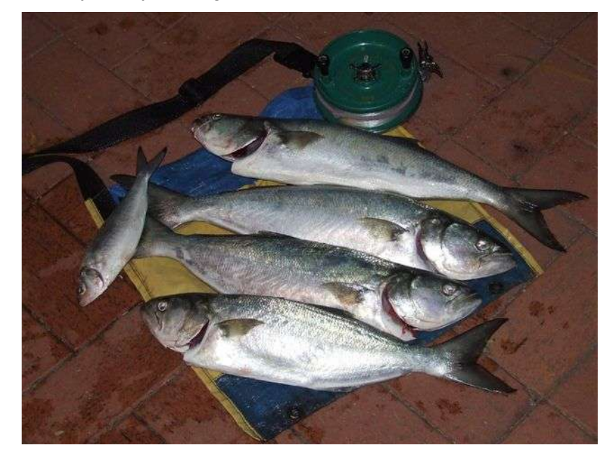
Four nice Tailor from a local beach.

A couple of days before that I got a nice school shark and got bitten off by others before I finally beefed up the trace line.