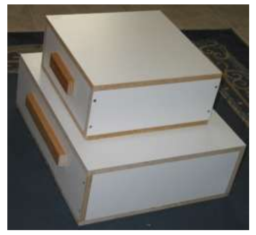
New boxes for the small and large scales.

New protective boxes have been made for the Club's two sets of electronic scales.