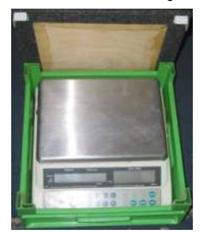
The old container for the small scales.

Got out the saw bench, drop saw, drills, clamps and lots of other tools and bits and pieces, grabbed some of those melamine offcuts and foam carpet underlay that has been getting in the way, measured everything up, bought some extra stuff, got cutting and screwing, and some hours later, volia!