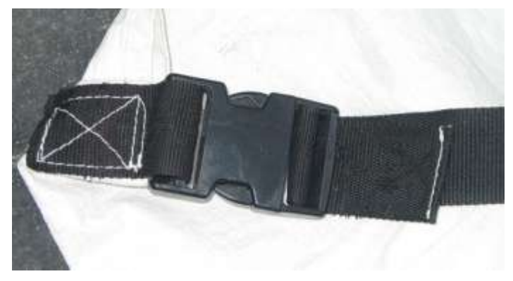
Adjustable quick release clip on strap of reef bag.

You are fishing on a reef. You have a few fish in your reef bag slung over your shoulder. Suddenly you are in the water swimming. Trying to get out, as you pull yourself over the edge, you find your reef bag now has 10 to 20 litres of water in it and is dragging you back in. No worries, you think, my reef bag has drain holes. But the drain holes are blocked by those fish and anyway it takes a long time for that much water to drain through those holes. OK. try to slip off the bag, but you have to lift the strap and that much weight over your head, and that's not easy in a hurry.