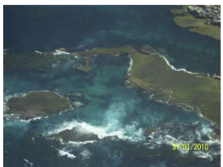
Rottnest's Radar Reef

Afterwards it keeps me lying awake in bed replaying the excitement over and over and then I can't wait to get back there again.