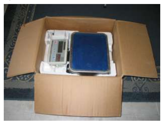
The old box for the large scales

So if anyone says "Aluminium boxes would be better" , nothing much has been wasted.