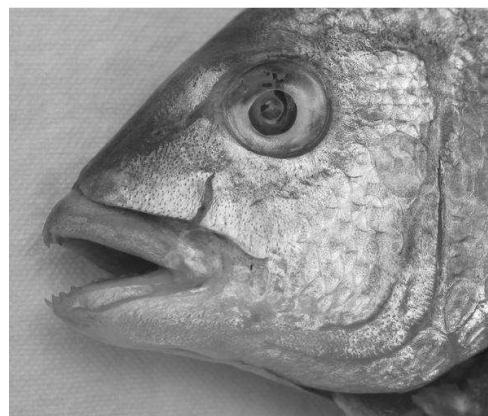
Yellowfinned Bream:- note "pointed" mouth, and prominent teeth.

Usually it is fairly easy to distinguish between the three species. Black Bream and Western Yellowfin Bream have a more pointed lower head and mouth area than the Tarwhine which is quite rounded at the front of the head. The Tarwhine has 6-7 scale lines above the lateral line whereas the Black Bream has 4 scale lines above the lateral line. The Western Yellowfin Bream is best distinguished for Black Bream by the yellowish coloration of the dorsal and anal fins. When all else fails, buy a good fish identification book. If in doubt about the identification of a fish species, keep the fish whole and freeze it. First take a good close up colour photograph of the fish as soon as possible because colours change rapidly after fish are removed from the water.