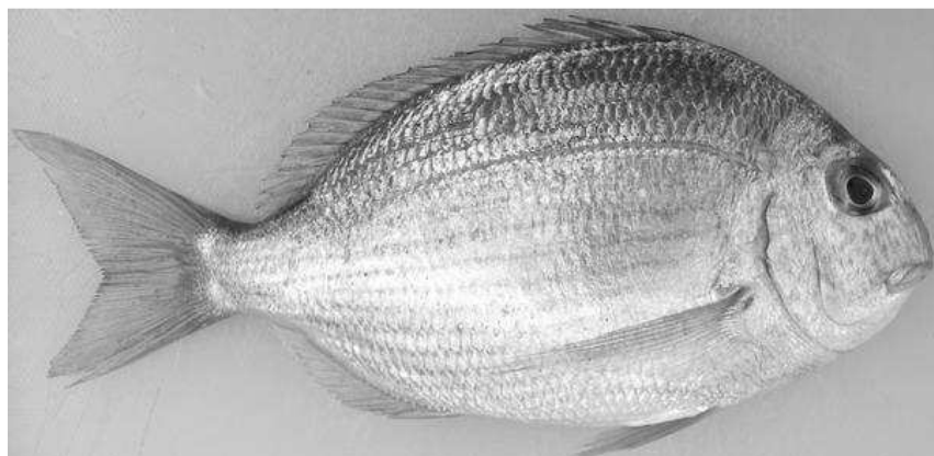
Tarwhine - note "rounded" mouth.

Yellowfin Bream is the more accepted common name for Western Yellowfin Bream.