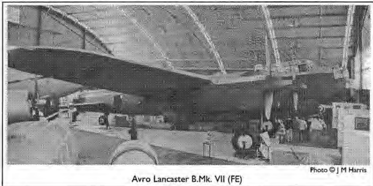
Avro Lancaster B.Mk. VII (FE)

So, why not come down and have a look? Better still, the Club can organise a special opening of the Museum in the evening and members and their families can come along. Just contact the Curator on 9311 4471, or the Museum Office on 9311 4470, for particulars.