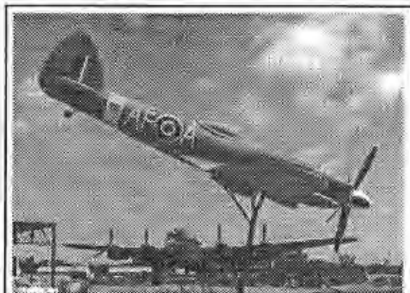
Supermarine Spitfire and Avro Lancaster before they were moved to the North Wing